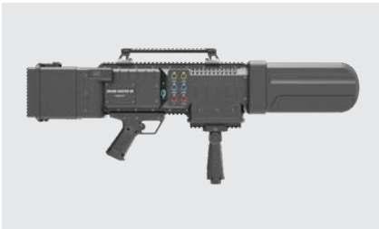
Drone Hunter XRS (Side View)